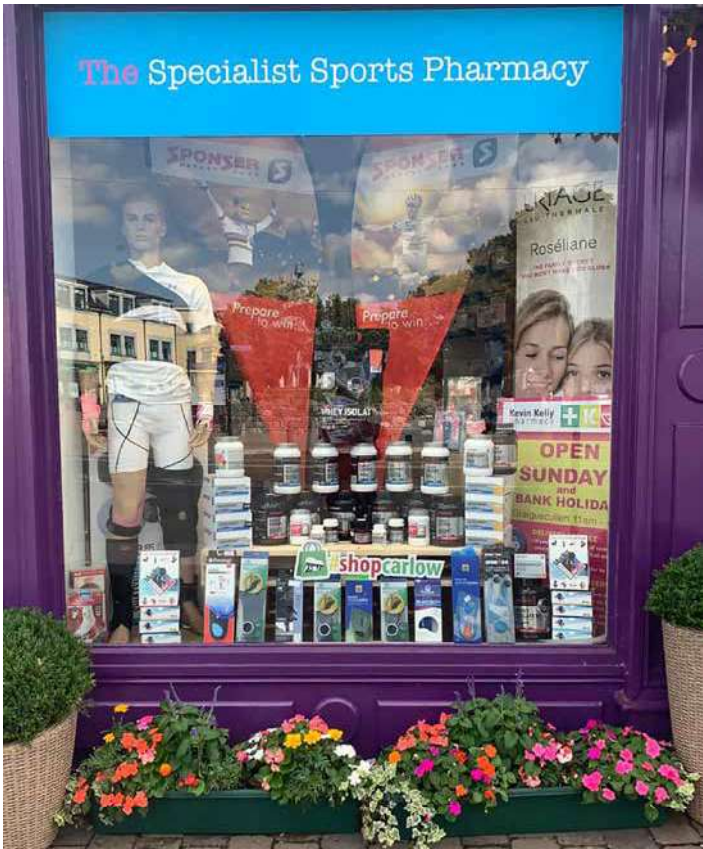
Kelly’s Pharmacy, Carlow

“I would also like to be an advocate for younger girls allowing them to realise that if they work hard and pursue what they love they can achieve both in the sporting and academic world.”